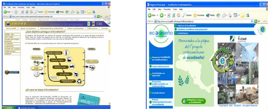
Fig. 1: Ecodesign Manuals based upon the PROMISE approach in the North of Spain and in Central America available on-line.

Most of the above mentioned manuals are online available like for example the two Spanish version of IHOBE and CEGESTI (see figure 1). The web-site addresses of the online available manuals can be found in the reference list.